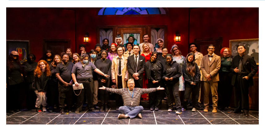
The cast of Clue, UMass Boston Performing Art's fall production.