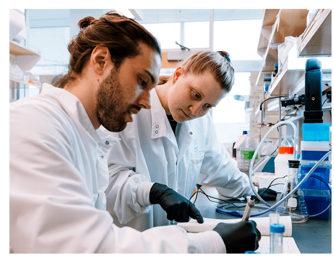
In fiscal year 2024, UMass Boston reported $81.1 million in annual research funding.