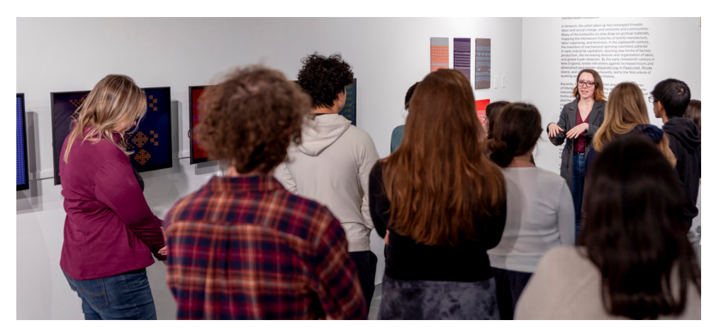
Installation view of Cat Mazza: Network at Gallery 360.

In the book, Warren shows that some of the first people to name and challenge the school-to-prison pipeline (STPP) in a way that created a movement for change were Black and Brown parents and students of color in places like the Mississippi Delta. The movement they created played a pivotal role in placing the STPP on the agenda of educators and policy makers and led directly to the adoption by the Department of Education of federal guidelines warning against racially discriminatory school discipline policies.