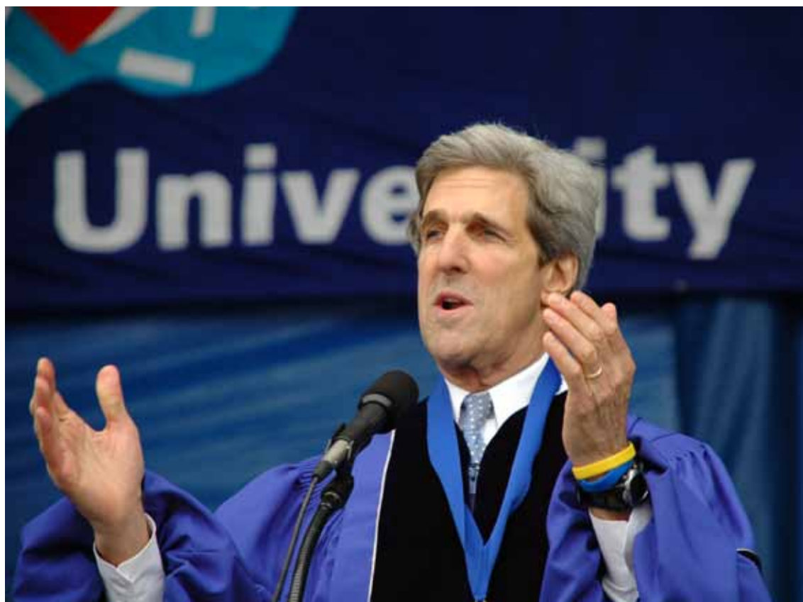
U.S. Senator John Kerry.

"Together, we are part of this country's grand march forward to its grand ideals—to make good on this improbable idea called America," said Kerry, who later reminded graduates, "Each new