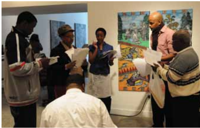
Left: Rehearsal at the Harbor Gallery for staged reading of two black theater classics, Raisin in the Sun by Lorraine Hansberry and Radio Golf by August Wilson.