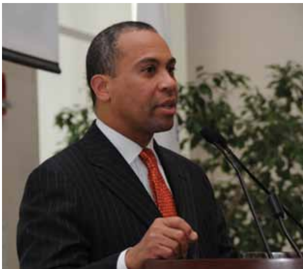
Above: Governor Deval Patrick speaks to the Massachusetts Black Business Alliance at the Campus Center.