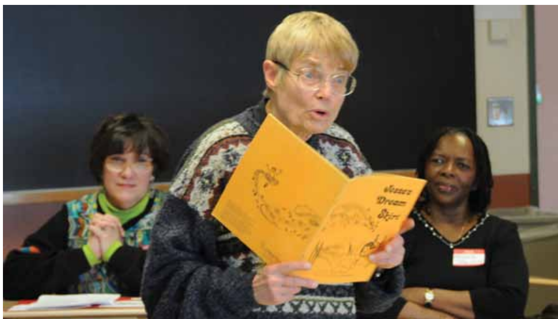
Role reversal: At the conference, teachers were the students.