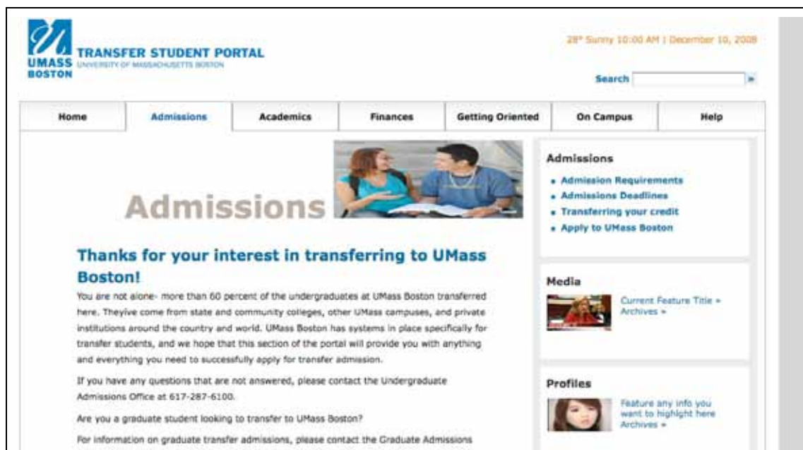
The new Web portal streamlines everything from learning about the campus to finding out how to transfer credits.

ing articulation agreements with our community college partners, the electronic transfer of transcripts and evaluation of credit, and implementation of a prospective student planning tool called u.select.”