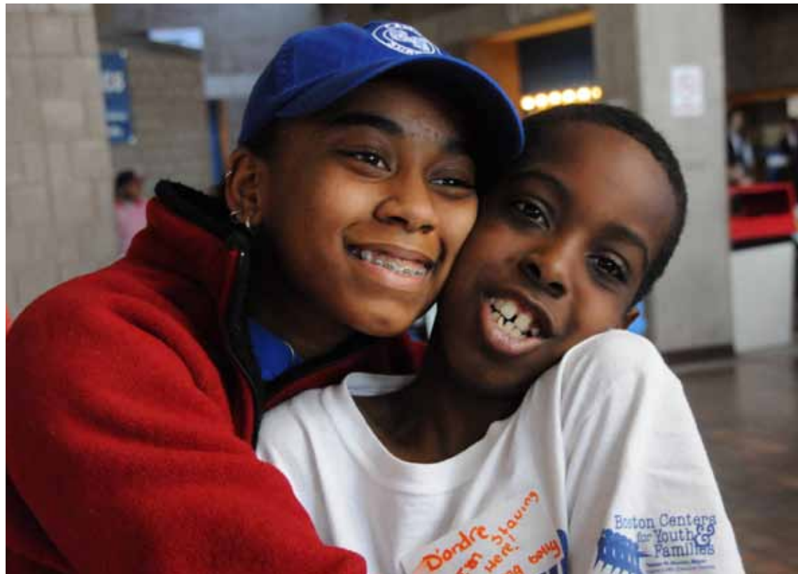
Just one of the many happy reunions at the Camp Shriver Reunion.

What sets Camp Shriver apart from other recreational opportunities is its unique commitment to creating an inclusive, sports-oriented day camp experience at no cost, in which children with and without intellectual disabilities play and learn together. Campers are provided transportation to and from camp, breakfast and lunch, and camp gear. While at camp, children receive instruction in a variety