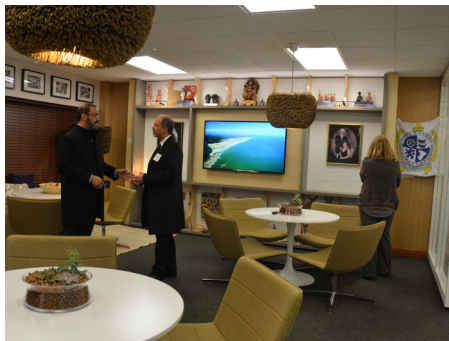
The Tiradentes Institute at the University of Massachusetts Boston will support students, faculty, and researchers.