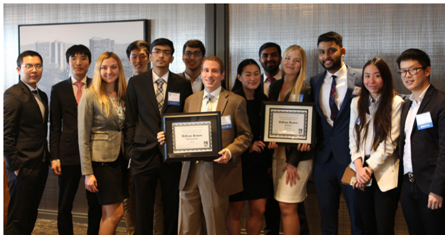
The UMass Boston Student Managed Funds team placed second in an investing competition.