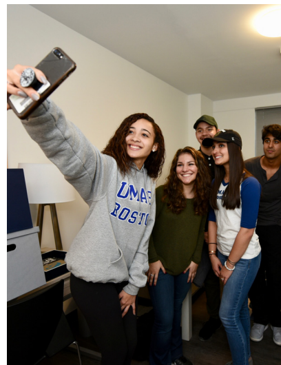
The residence halls will be ready for incoming students in the fall.

The university's first freestanding parking garage has taken shape, with the precast concrete structure now in place. The 1,400-space garage is on schedule to open during summer 2018. On the garage exterior, crews are working to complete the two stair and elevator cores and install façade enhancements, while plumbers and electricians prepare the utilities.