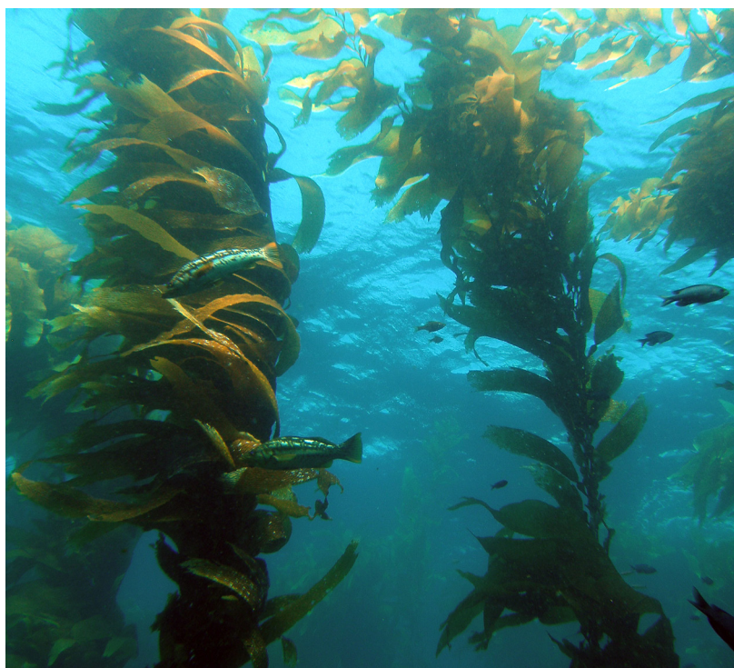
Citizen scientists will now have the chance to explore kelp forests from their desks.