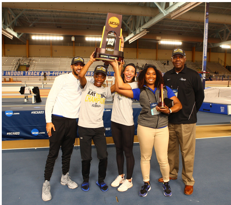
The women’s track and field team brought home their fifth national title this year.